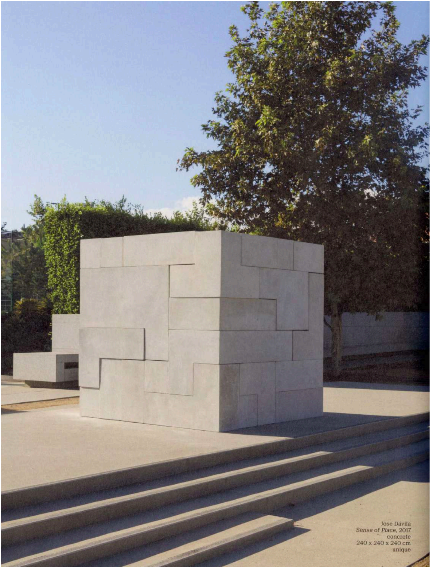
Jose Dávila Sense of Place , 2017 concrete 240 x 240 x 240 cm unique